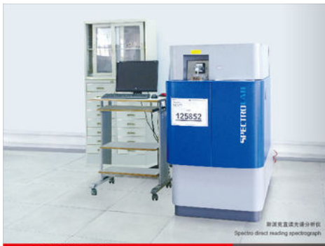
最新型直读光谱分析仪 Spectro direct reading spectrophotometer